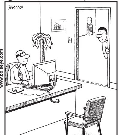
"The boss is giving a PowerPoint presentation on independent problem solving this afternoon... but, first he needs you to turn on his computer."